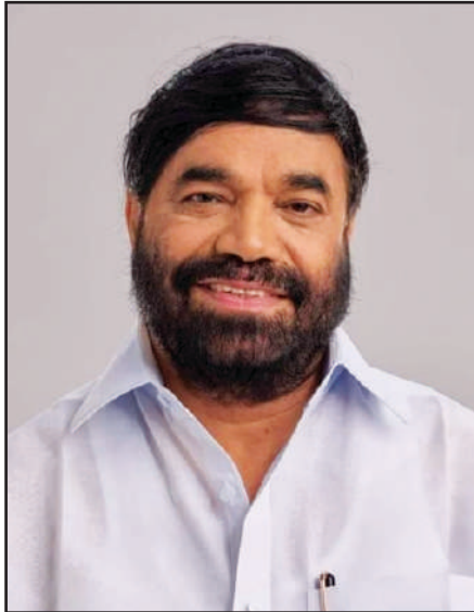
Shri V N Vasavan Chairman - General Council (Minister for Co-operation and Registration)